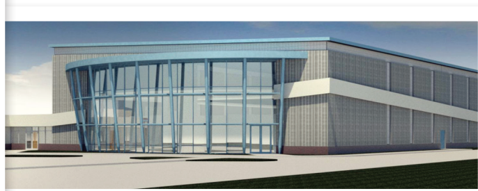
Northwood-Kensett Community Schools Wellness Center Addition Proposal