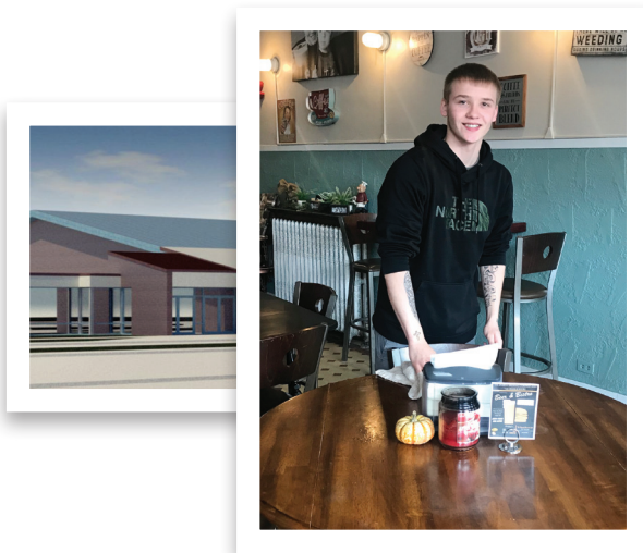
Student internship with a local business

The Northwood-Kensett Community School District strives to partner with the City of Northwood, Worth County, other school districts, community colleges, businesses, and non-profit organizations. This includes but is not limited to offering post-secondary education courses with North Iowa Area Community College, internships with area businesses, sharing with the City of Northwood Parks & Rec Department, and others.