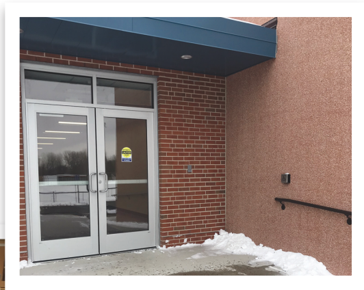
ADA compliant entrance to the Jr./Sr. High School