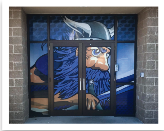
Window wraps at both Northwood-Kensett school buildings support campus security efforts

Along with providing strong academic programs and extracurricular activities, the issue of campus safety is a vital concern. The Northwood-Kensett Community School District is committed to safeguarding our students' and staff's security as they pursue their educational endeavors. To help create a safe and secure environment, our school district has taken preventive steps such as crisis response planning, continuous training of staff and students, and implementing technology which includes video surveillance cameras, physical access controls, and paging/radio systems.