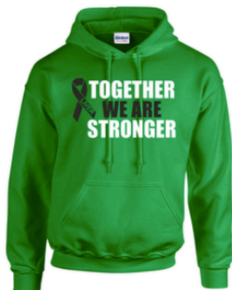
Gildan Youth/Adult Hooded Sweatshirt $25.00