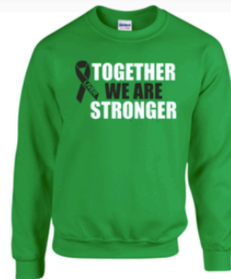
Gildan Crew Sweatshirt $20.00