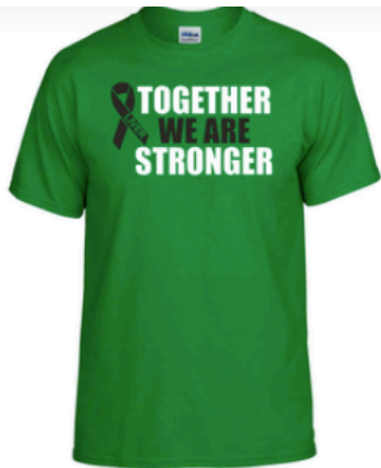
Gildan Youth/Adult Ultra Dryblend T-Shirt (50/50 Tee) $15.00