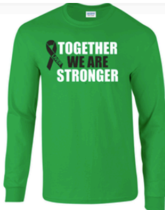
Gildan Youth/Adult Ultra Cotton Long Sleeve Tee $18.00